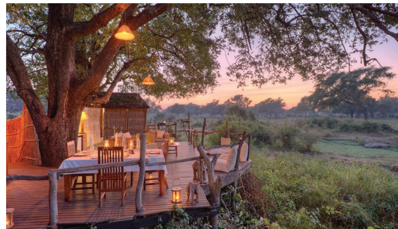
ABOVE: The stunning Jackalberry Treehouse at Flatdogs Camp is rustic, romantic and right on the edge of a lagoon, offering a front-row seat to incredible wildlife from its beautiful deck. OPPOSITE [CLOCKWISE FROM TOP] The luxury safari tents at Time + Tide Chinzombo are located on the banks of the Luangwa River, where honking hippos provide the glorious soundtrack; Boating safaris let you view wildlife from a totally different perspective; Zambia is a paradise for birdwatchers.