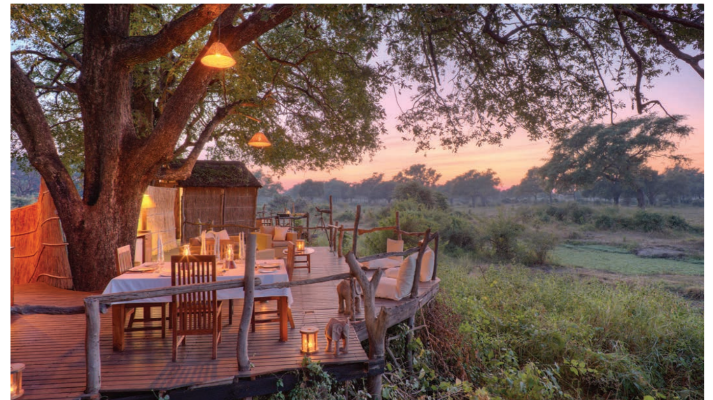
ABOVE: The stunning Jackalberry Treehouse at Flatdogs Camp is rustic, romantic and right on the edge of a lagoon, offering a front-row seat to incredible wildlife from its beautiful deck. OPPOSITE [CLOCKWISE FROM TOP] The luxury safari tents at Time + Tide Chinzombo are located on the banks of the Luangwa River, where honking hippos provide the glorious soundtrack; Boating safaris let you view wildlife from a totally different perspective; Zambia is a paradise for birdwatchers.