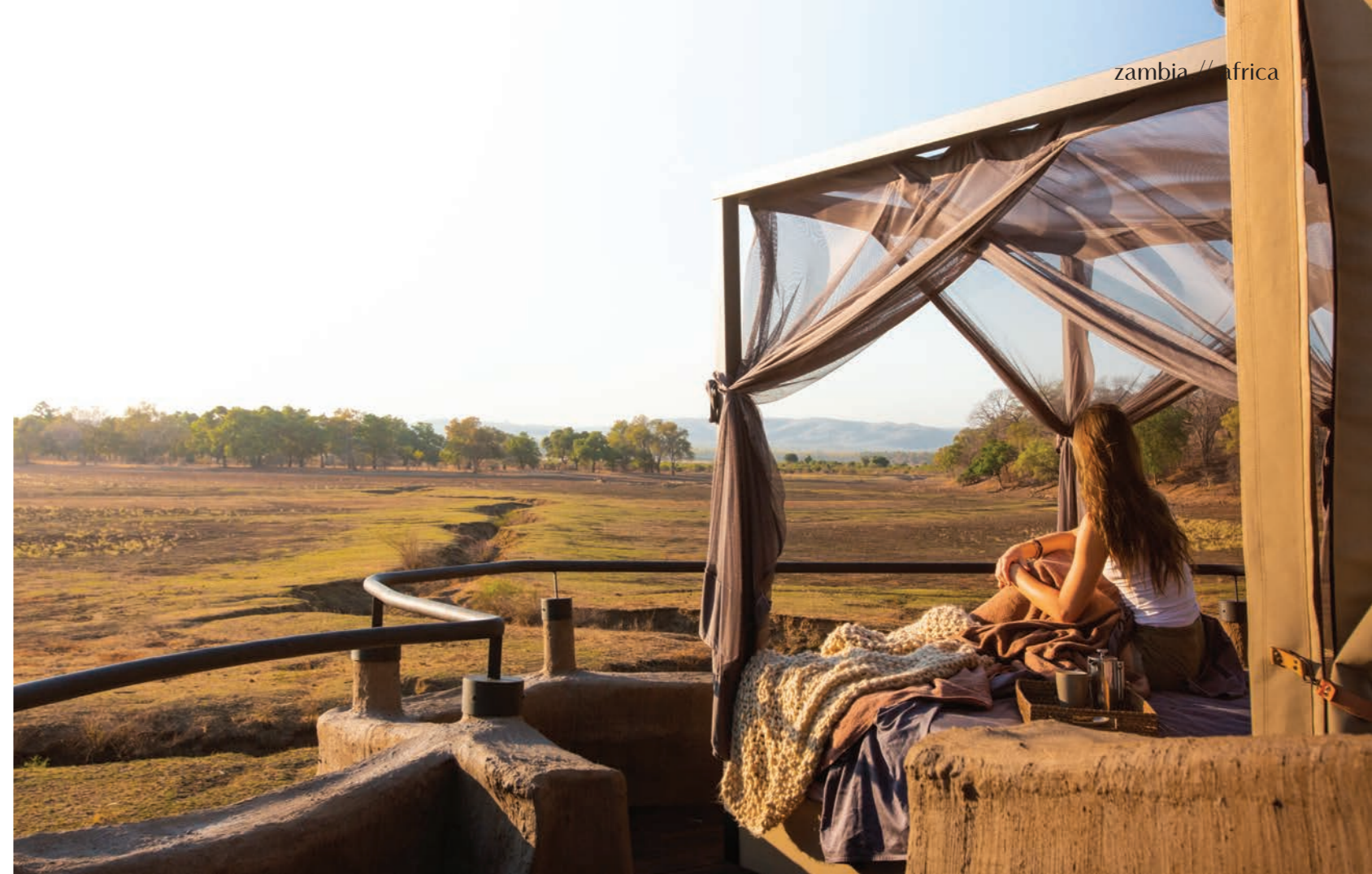
ABOVE: Walking safaris offer an intimate encounter with wildlife and the untamed African bush. They originated in Zambia's South Luangwa National Park, and no trip here is complete without heading out on foot. OPPOSITE [TOP] The luxury safari tents at Puku Ridge Camp feature a tower with star bed, so you can sleep under the vast African sky. [BOTTOM] At Puku Ridge there's an open-air lounge and dining area, campfire, and a viewing hide overlooking a waterhole that teems with wildlife, day and night.

private dining on our enormous treehouse deck. It's the first time I've ever seen a table laid with condiments and a slingshot, but the baboons in Zambia are very cheeky! 'Flat dog' may be another name for a crocodile, but a hippo was actually our first wildlife encounter at this lovely spot. Later, elephants looked on as we took advantage of the beautiful outdoor showers. What a welcome to Zambia.