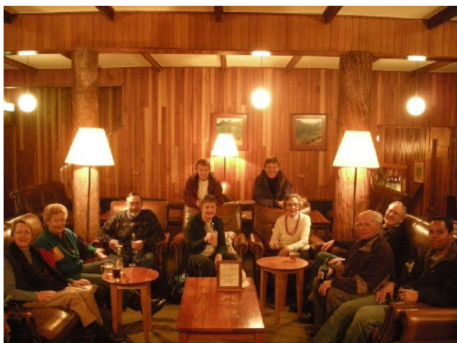
The warm atmosphere of Cradle Mountain Lodge