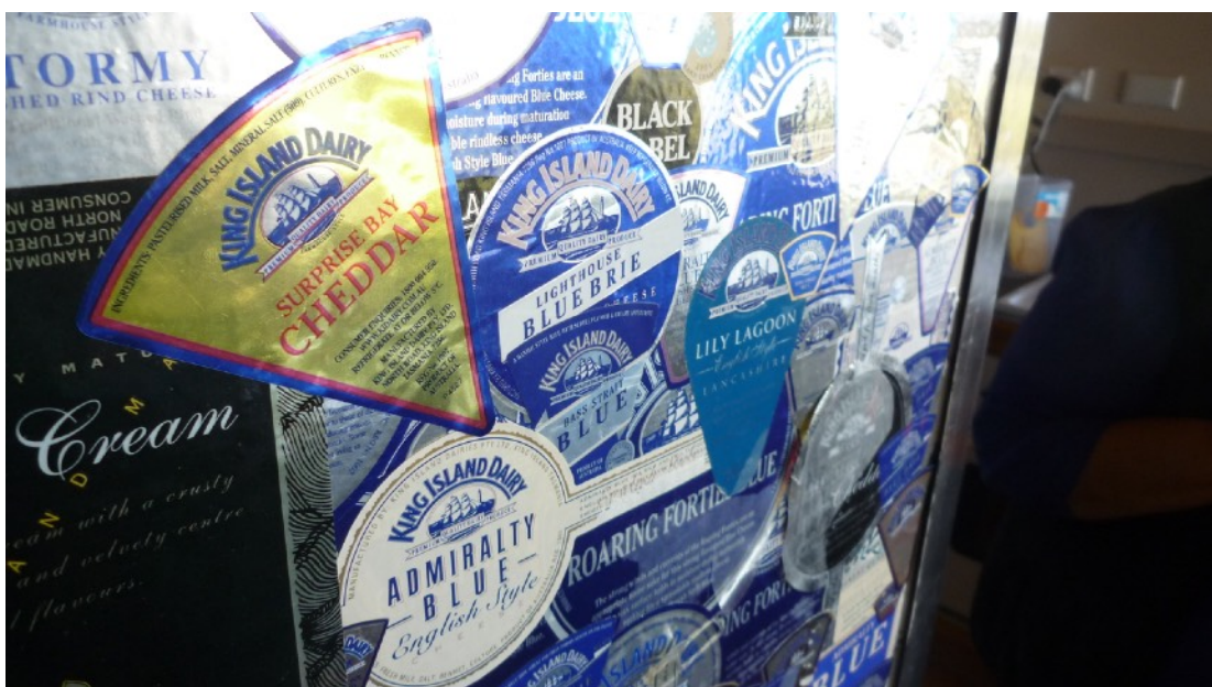
The renowned King Island Dairy

Note: there are no fixed departure times for flights conducted on any day of this tour. Departure times will be determined on a day by day basis by discussion between the pilot, tour guide and participants.