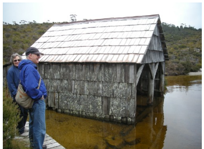
The Dove Lake circuit