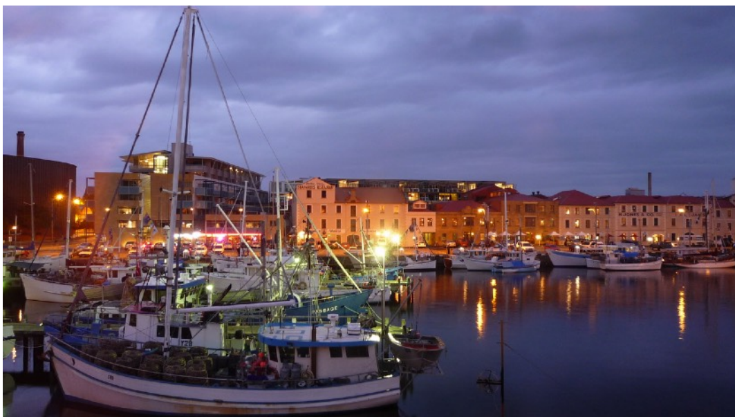
Macq01 Hotel on the waterfront, Hobart